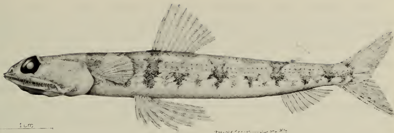
Fig. 3. Synodus rubromarmoratus n. sp. Paratype USNM 218792, 71.2 mm SL, Mrs. Watson's Bay, Lizard Island, Great Barrier Reef.

not in a discrete group; peritoneal spots 12; peritoneum pale; anal-fin base shorter than dorsal-fin base; nose flap on anterior nares long and broad.